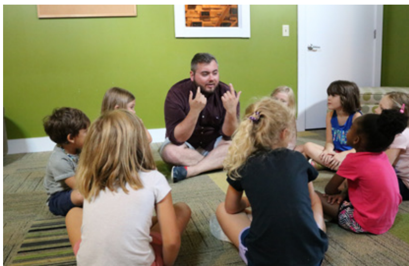
Averitt Center for the Arts.