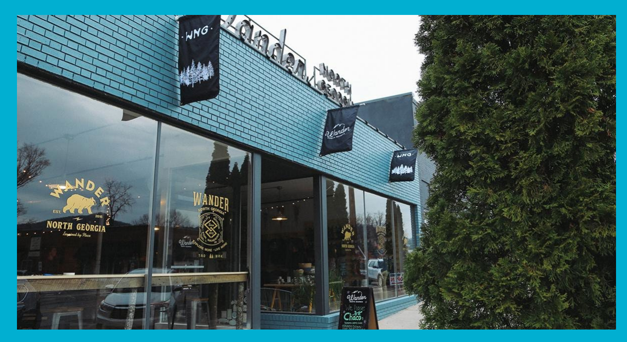
The Wander North Georgia outdoor store in Clayton has brought tourism and young families to the town by maintaining a popular social media presence that highlights Instagramworthy spots in North GA

A few towns in North GA have revitalized and become more tourist friendly. To the west of Hiawassee, Clayton stands out with its downtown full of retail and restaurants, and its ability to attract young people and families both to visit and to live, something Hiawassee struggles with. It is difficult for these small mountain towns to balance appealing to younger people and tourists while still maintaining their community and identity.